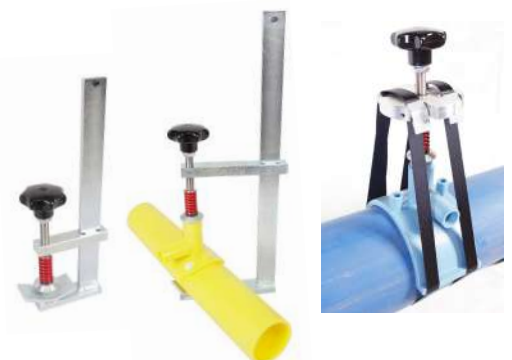
Saddle Clamp 125mm