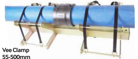
Vee Clamp 55-500mm